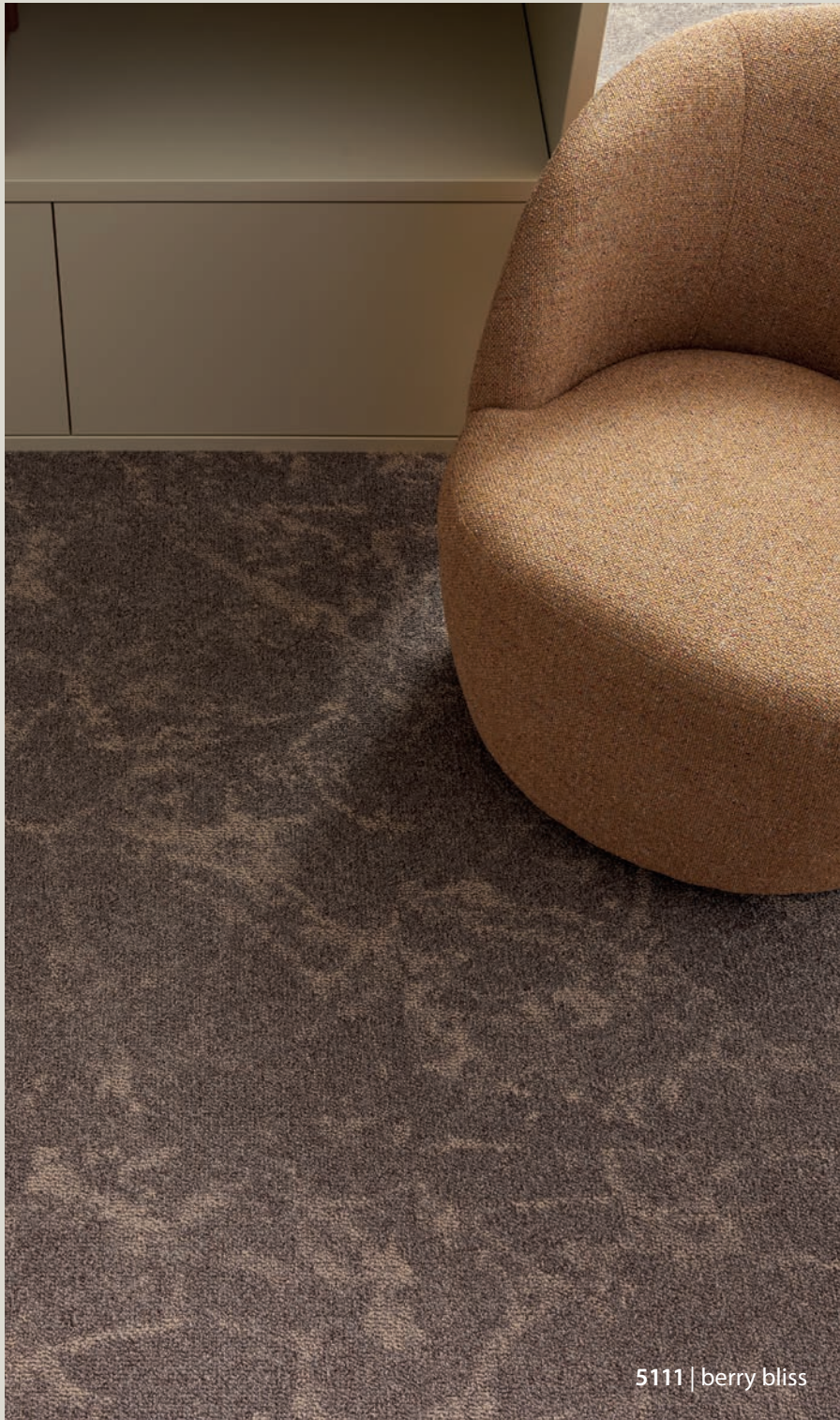
5111 | berry bliss