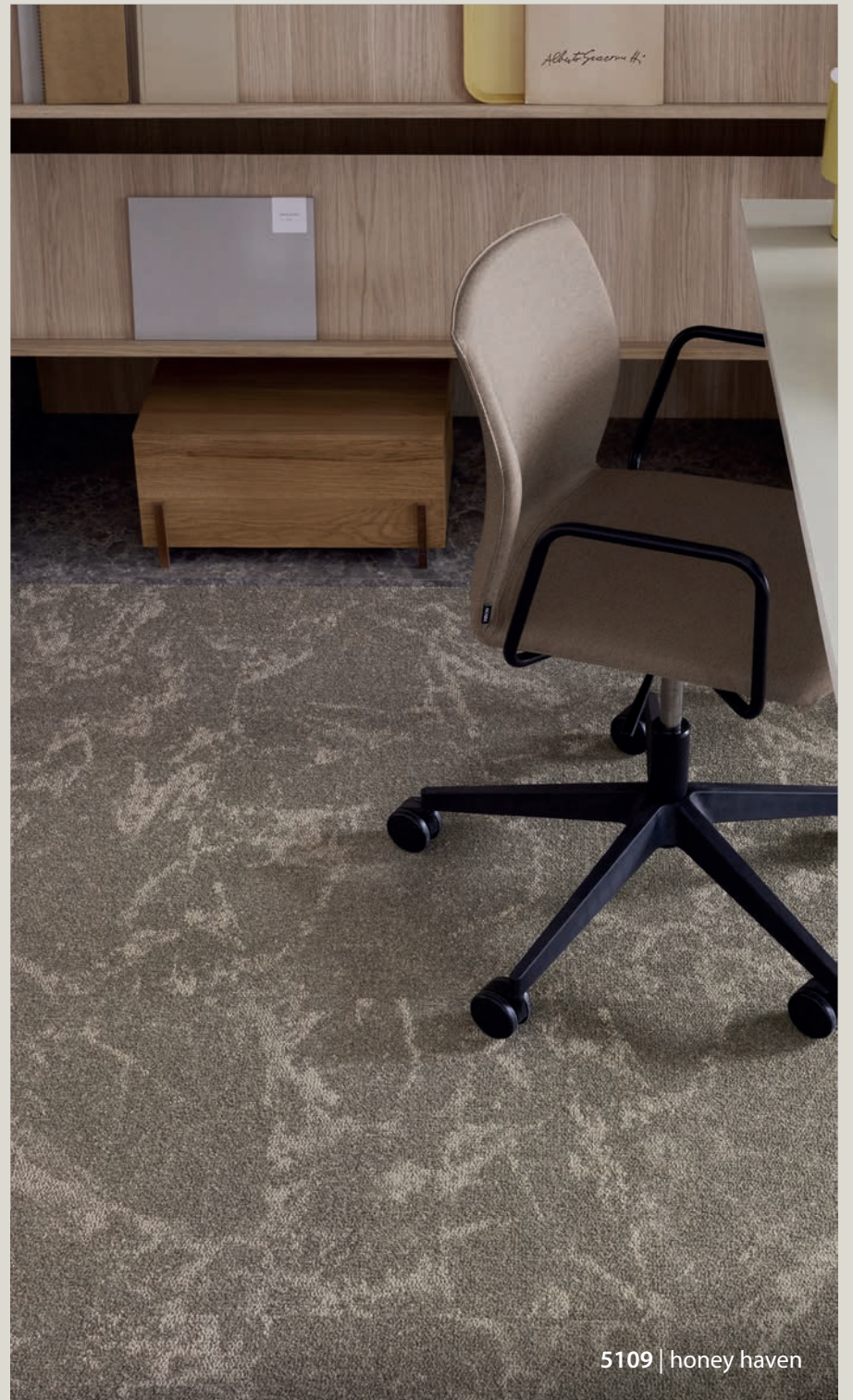
5109 | honey haven