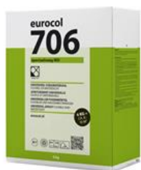
Package 4 kg