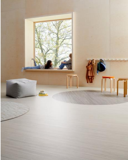
Examples of use areas