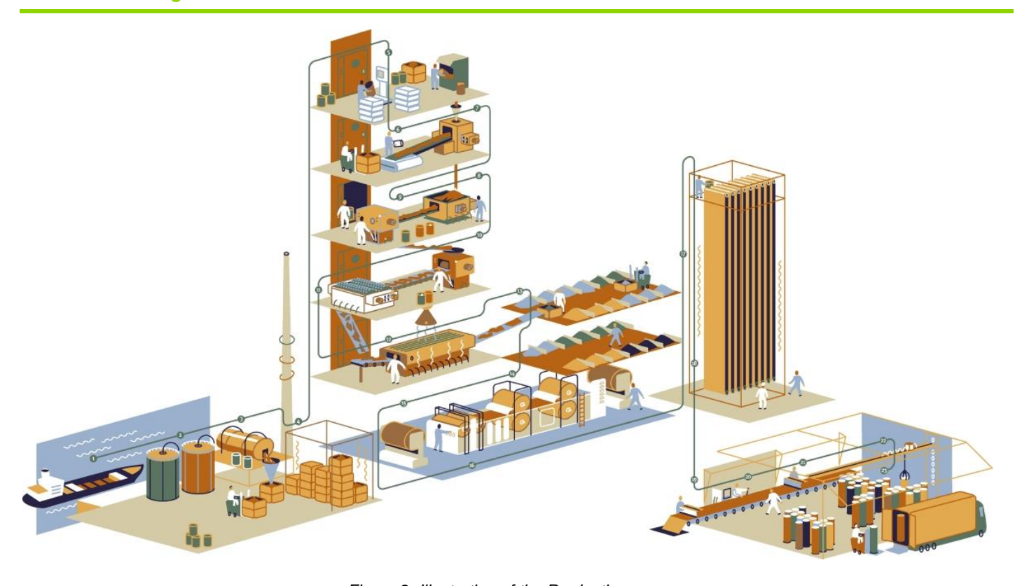
Figure 2: Illustration of the Production process