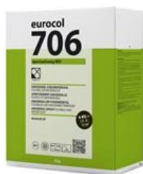
Package 4 kg