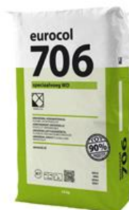
Package 23 kg

The 706 Euro grout special WT is available in the next colours: