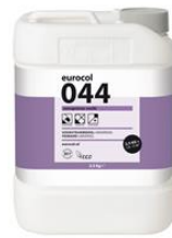
Package 2,5 kg