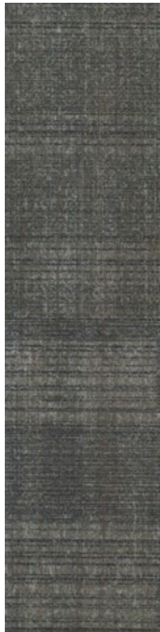
004316 | warm 3