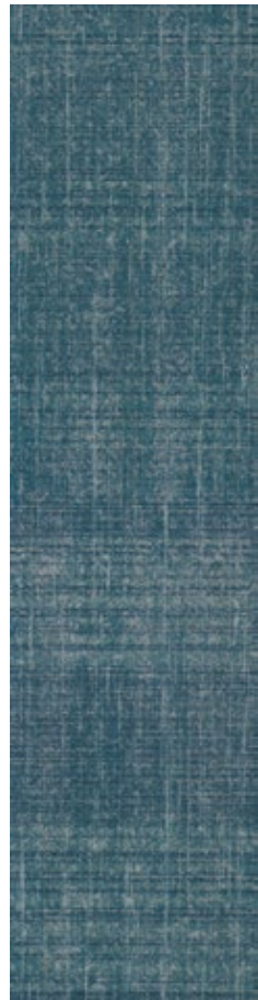
004385 | blue hue