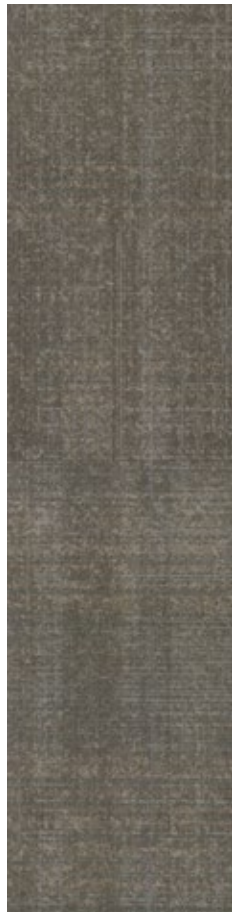
004394 | warm 1