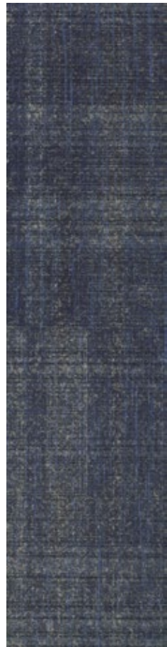
004392 | violet hue