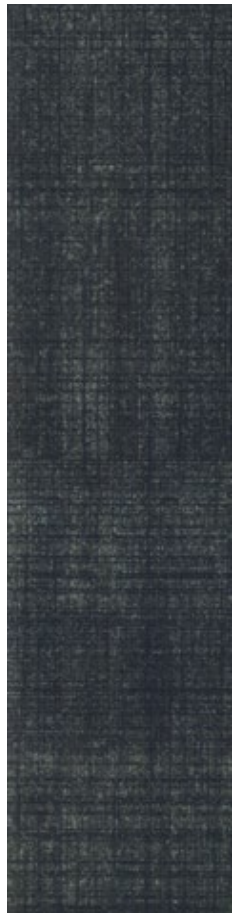
004411 | cool 3