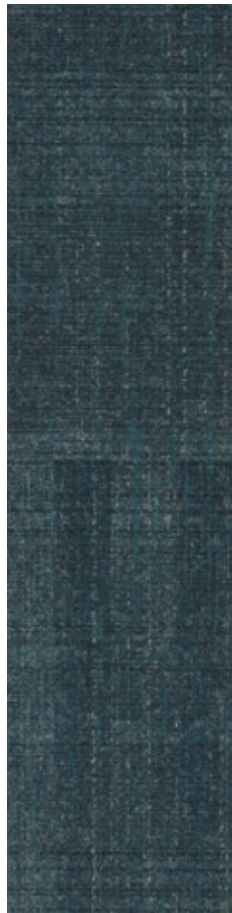
004388 | indigo hue