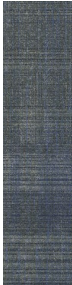
004393 | violet tone