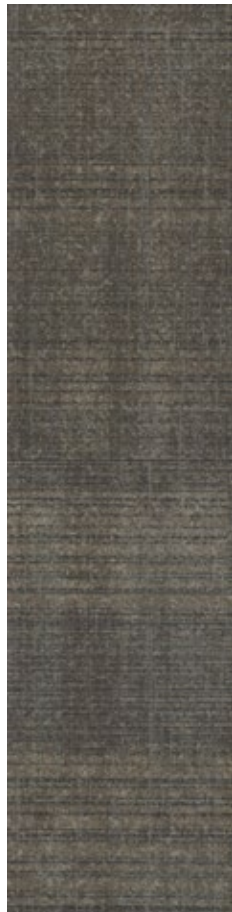
004395 | warm 2