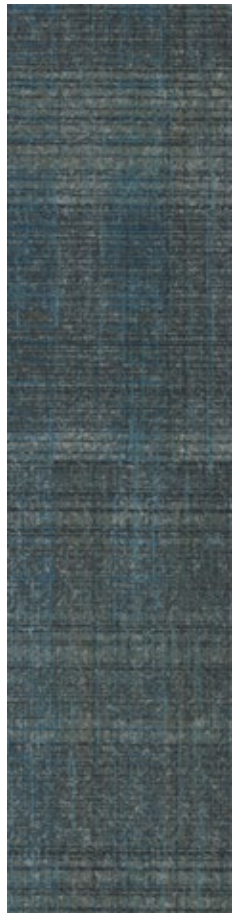
004389 | indigo tone