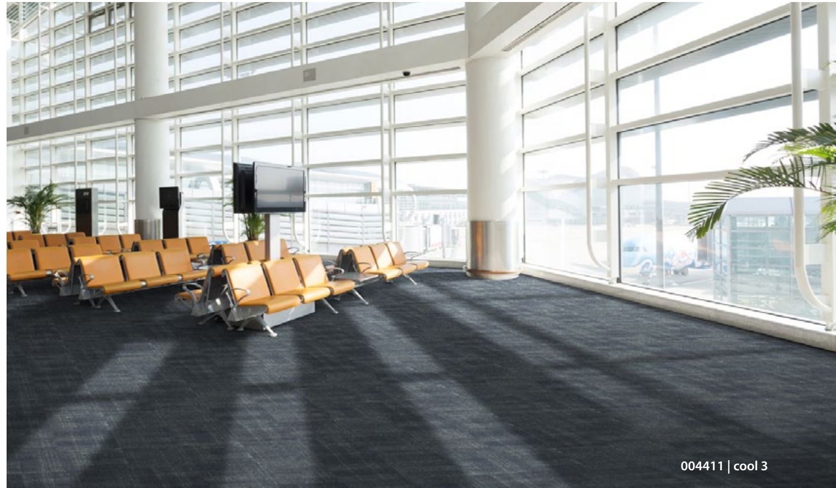
004411 | cool 3