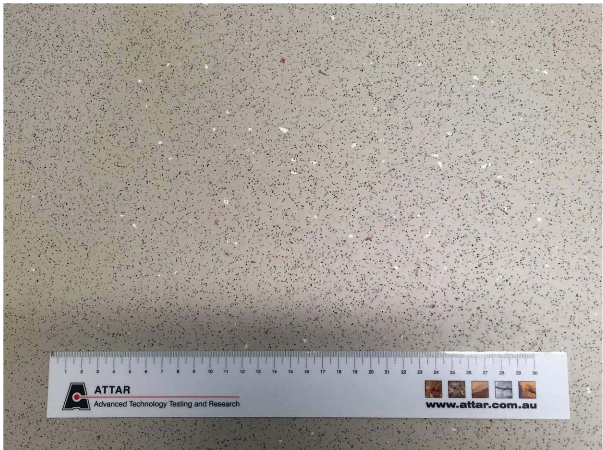
Figure 1: Safe Step R11.