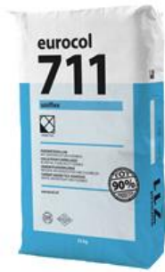
Package 25 kg