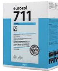
Package 5 kg