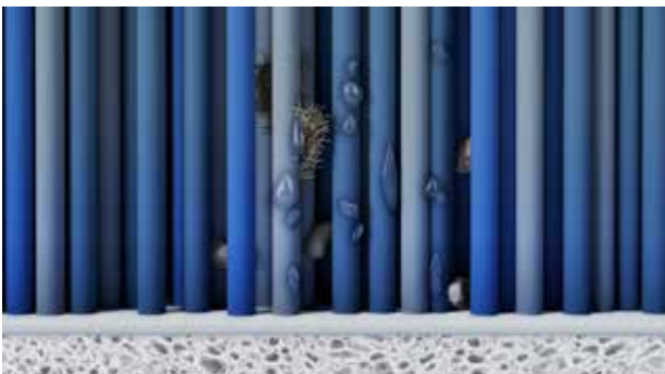
EXAMPLE CLOSE-UP OF FLOTEX FIBRES BEFORE CLEANING

The highly dense pile surface of straight, upright Nylon 6.6 fibres makes Flotex incredibly easy to clean. The tightly packed fibres reduce the potential for soiling deposits whilst the impermeable backing means it can be cleaned down to the base of the flock, making Flotex a truly washable textile floor covering.