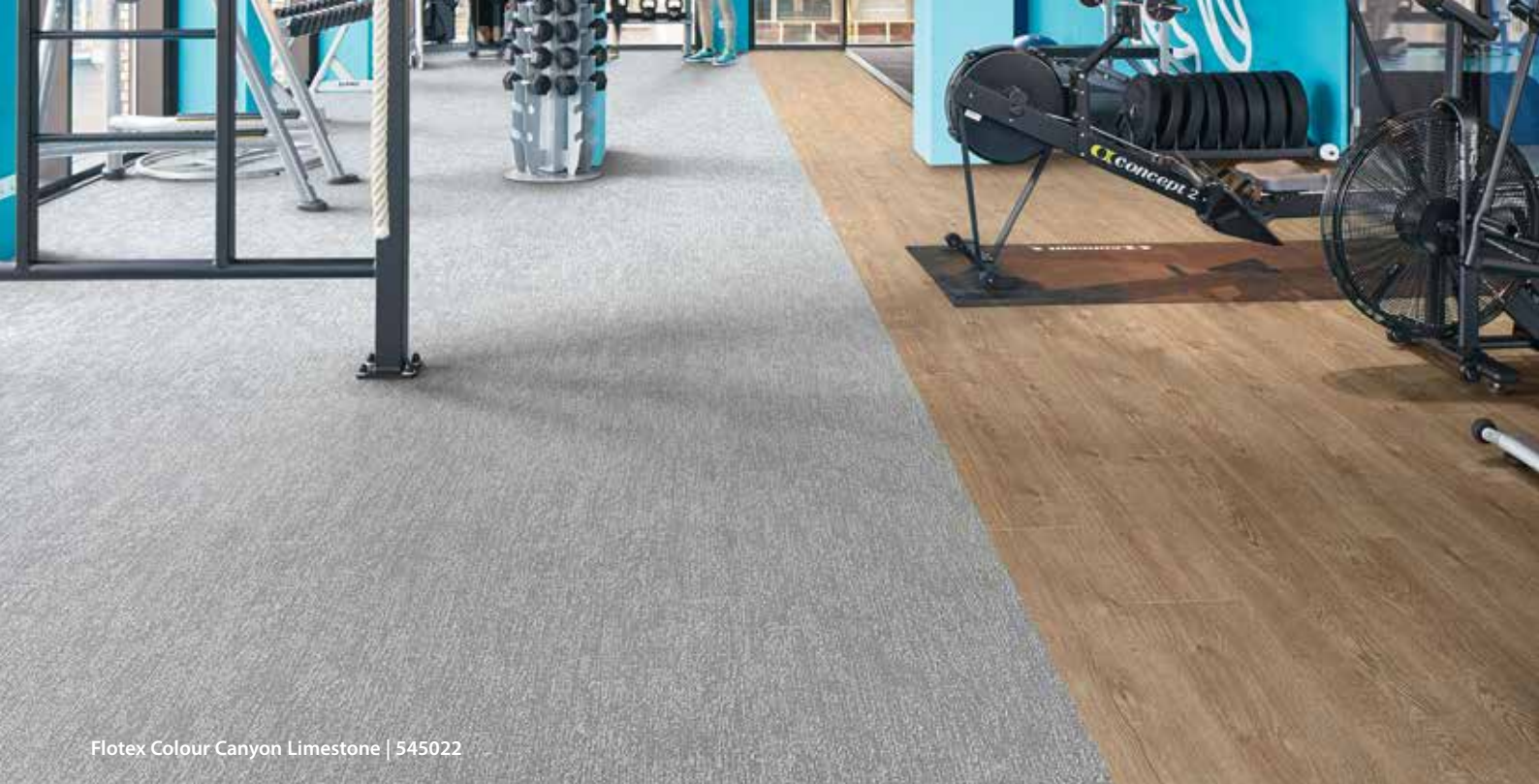
Flotex Colour Canyon Limestone | 545022