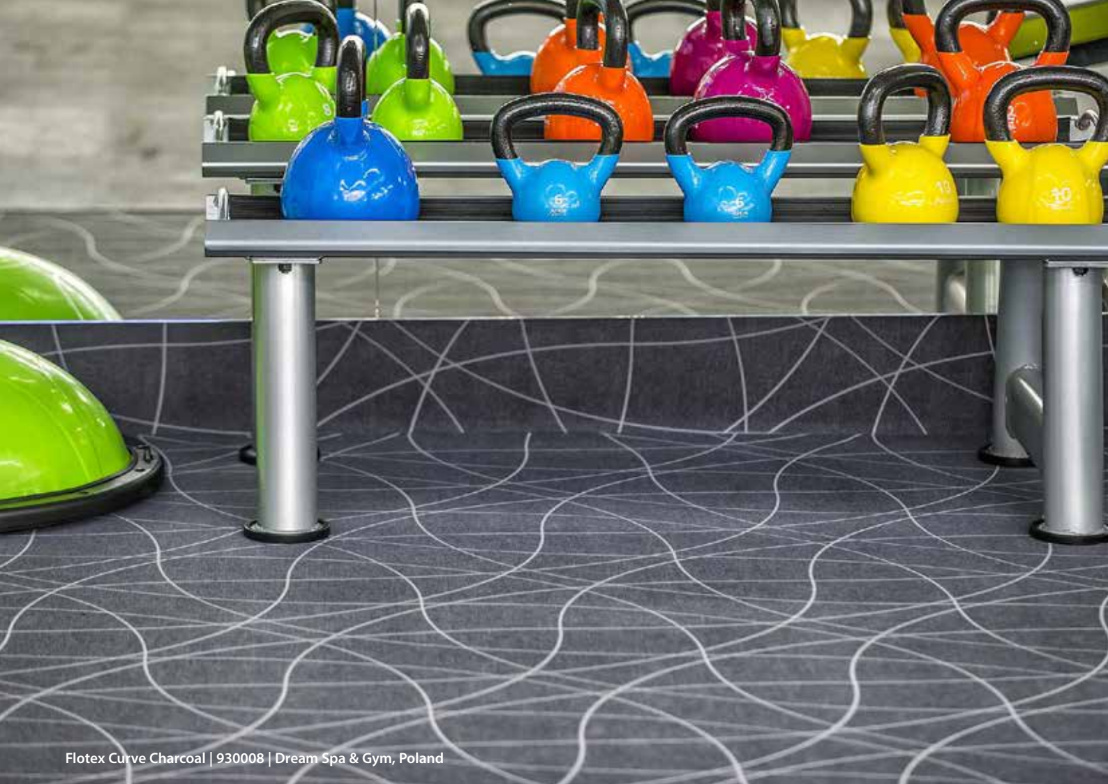
Flotex Curve Charcoal | 930008 | Dream Spa & Gym, Poland