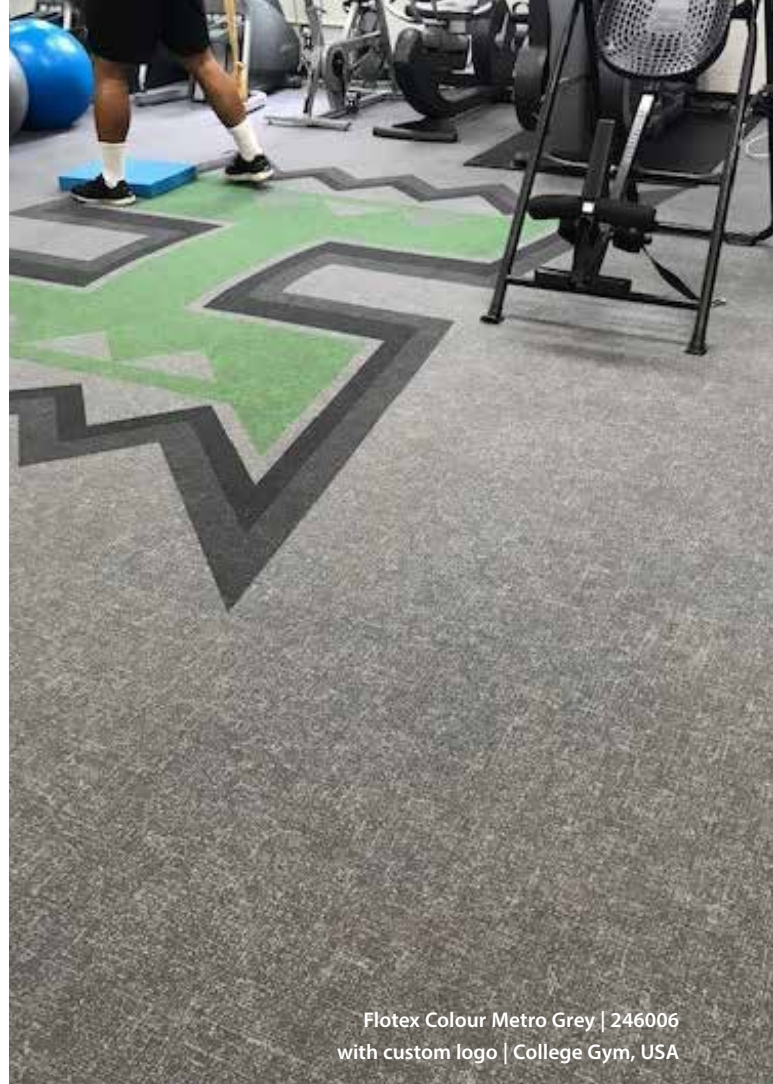
Flotex Colour Metro Grey | 246006 with custom logo | College Gym, USA

As well as slip resistance and good acoustic properties, Flotex achieves the prestigious Allergy UK Seal of Approval™ and Eurofins Comfort Gold certification. It attains the Allergy UK certification thanks to its highly dense surface pile, which captures fine dust