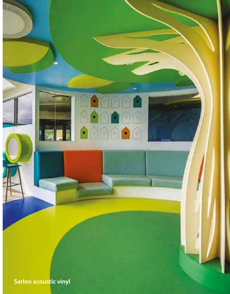
Sarlon acoustic vinyl

Acoustics can greatly affect a person's level of comfort and concentration. Minimising background noise, echo and reverberation is important. For example, soft surfaces and furnishings will absorb sound to prevent echo and contain sound. Lowered, sound absorbing ceilings will also help shorten the reverberation time of sound to make speech easier to understand. The provision of quiet spaces within the building is also an important consideration.