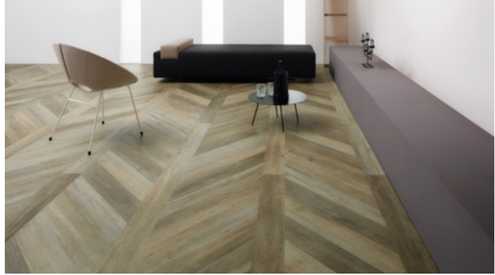
Hungarian Point Laying Option 2

Note: As with any geometric design, irregularities or undulations in the subfloor can result in the bond of tiles or planks drifting during installation. This is particularly important with the installation of Hungarian point planks if the points of the planks are to meet consistently and particular attention should be given to the preparation of the subfloor to ensure that the highest level of subfloor regularity is achieved i.e. within SR1 surface regularity standard