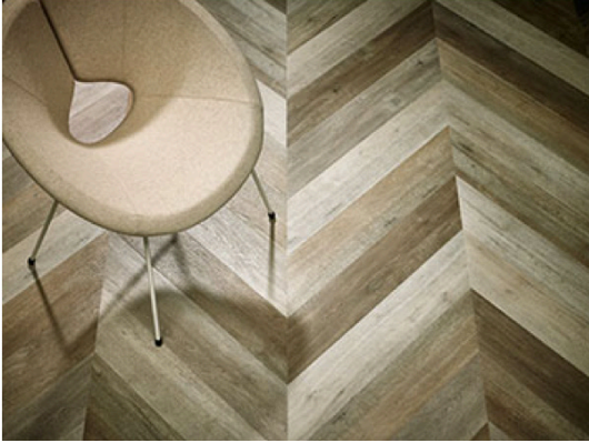
Hungarian Point Laying Option 1