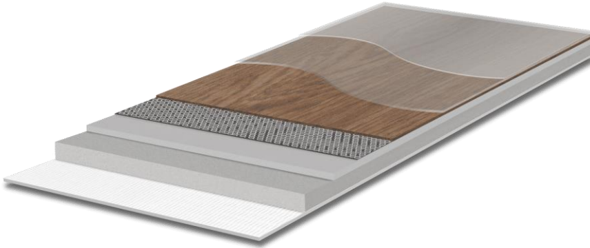
Figure 1: Typical construction