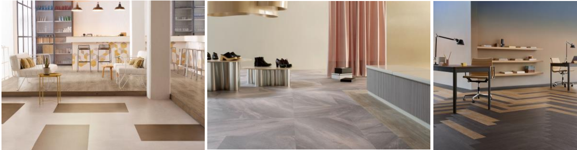
Examples of use areas