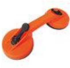
Double or triple cup suction lifter