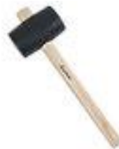
Non-Marking Rubber Mallet