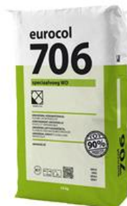
Package 23 kg

The 706 Euro grout special WT is available in the next colours: