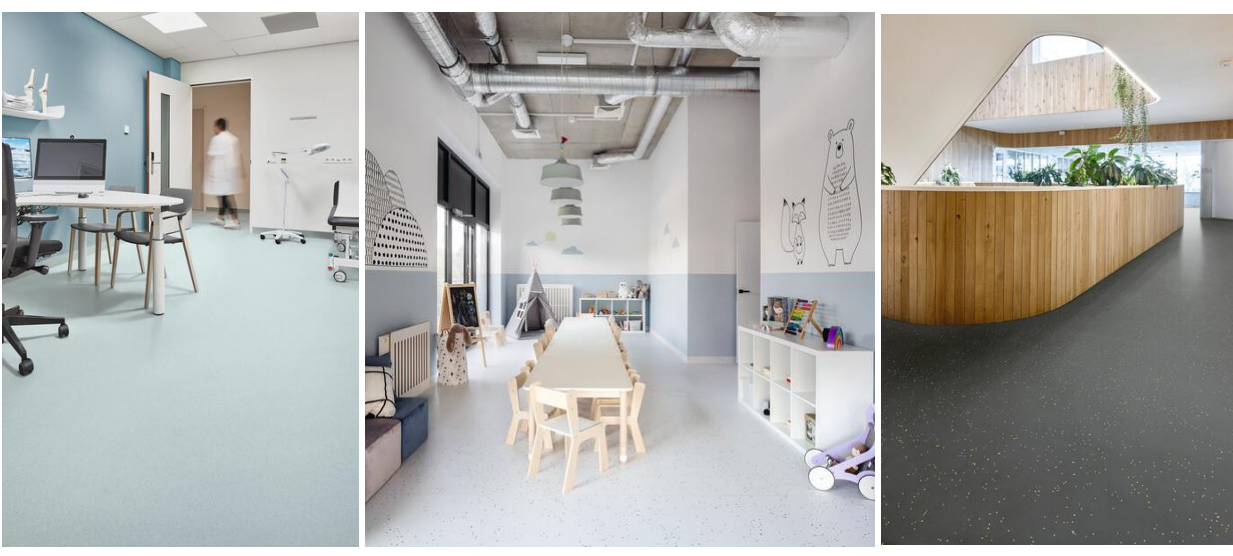
Examples of use areas