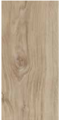
light honey oak