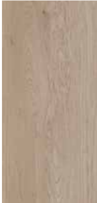
whitewash elegant oak