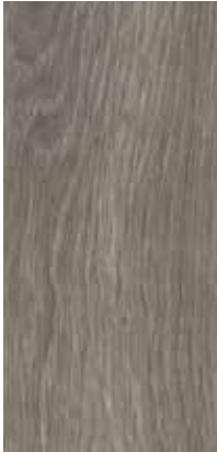
grey giant oak