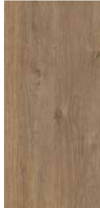
light rustic oak