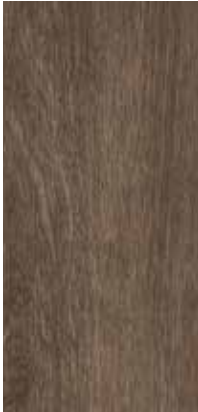
chocolate collage oak