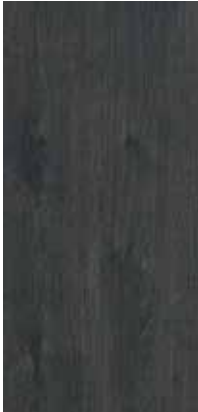
black rustic oak