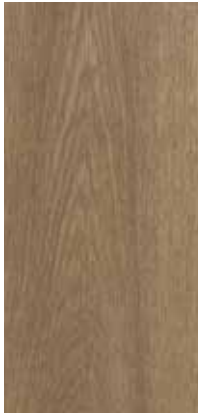
golden collage oak