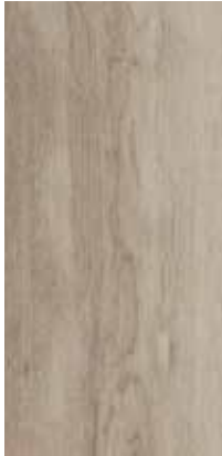
white autumn oak