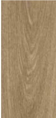
natural giant oak