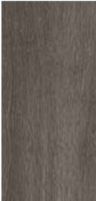
grey collage oak