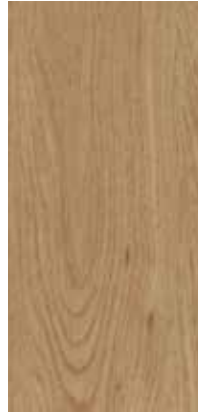
honey elegant oak