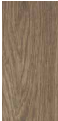
natural collage oak