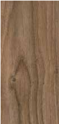
deep country oak