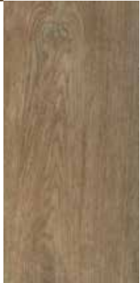
classic autumn oak