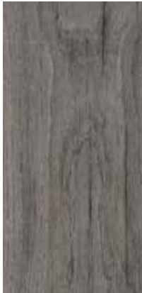
rustic anthracite oak