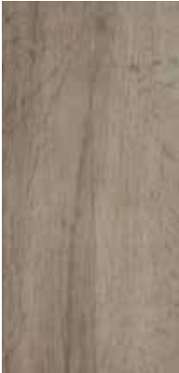
grey autumn oak