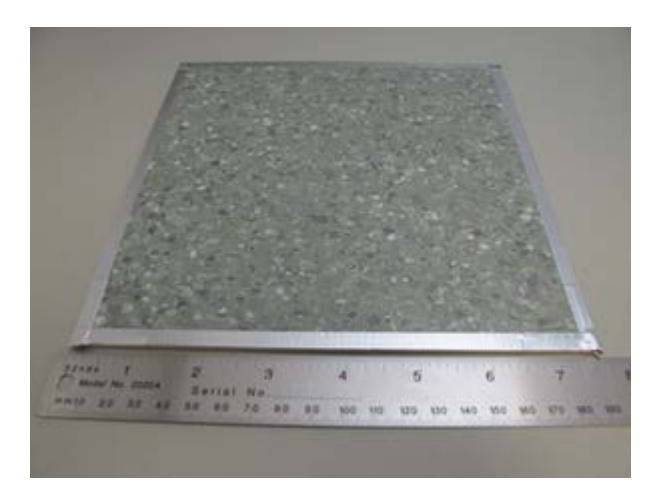
Photo Documentation – The product sample specimen is photographed immediately following specimen preparation and prior to initiating the conditioning period. Typically, the top and bottom faces of the specimen are photographed. Bottom faces may show a stainless steel plate or other substrate if prescribed by the standard.