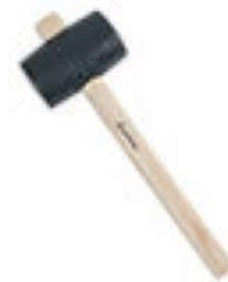
Non-Marking Rubber Mallet