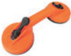
Double or triple cup suction lifter