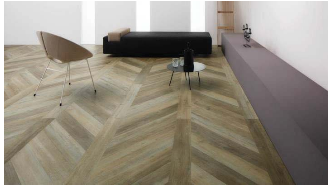
Hungarian Point Laying Option 2

Note: As with any geometric design, irregularities or undulations in the subfloor can result in the bond of tiles or planks drifting during installation. This is particularly important with the installation of Hungarian point planks if the points of the planks are to meet consistently and particular attention should be given to the preparation of the subfloor to ensure that the highest level of subfloor regularity is achieved i.e. within SR1 surface regularity standard