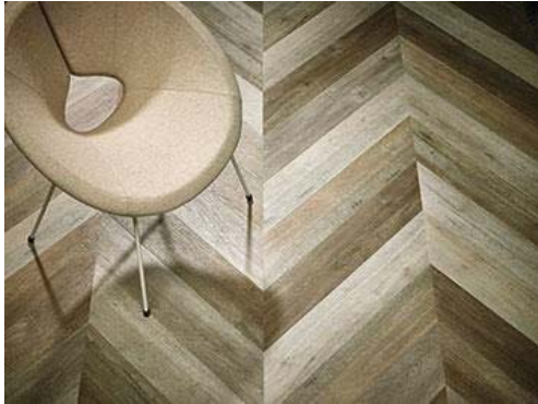
Hungarian Point Laying Option 1