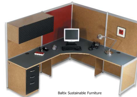
Baltix Sustainable Furniture