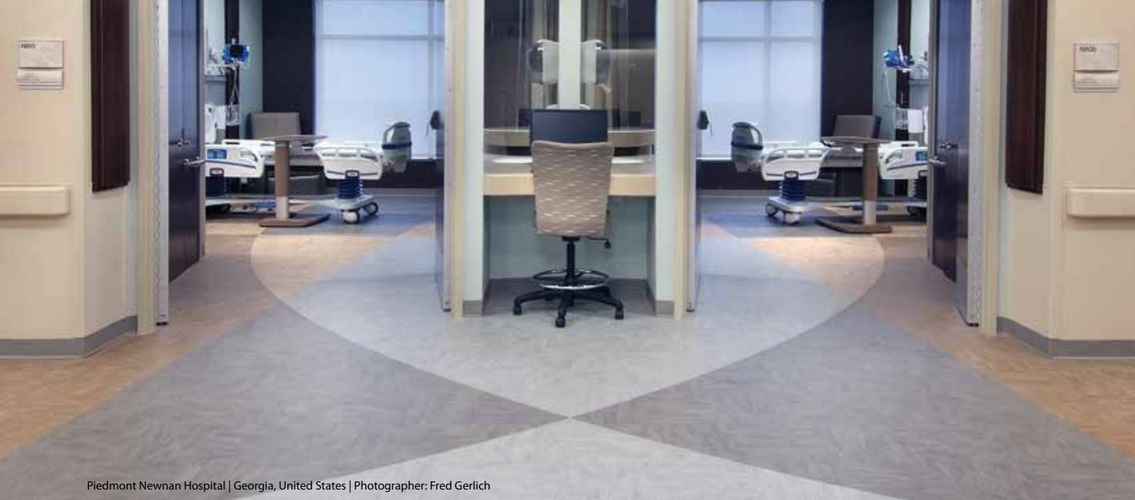
Piedmont Newnan Hospital | Georgia, United States