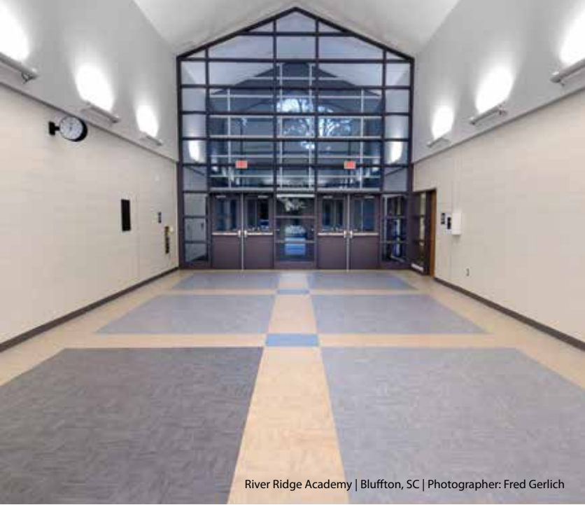
River Ridge Academy | Bluffton, SC