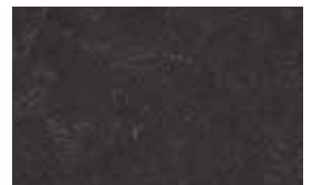
370735 black hole