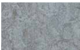
305335 dove blue