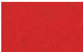
374335 red glow