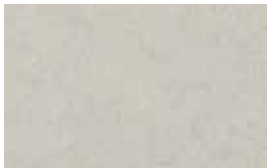
386035 silver shadow