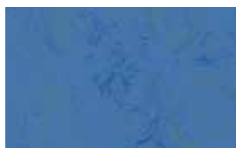
373935 blue glow