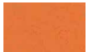
373835 orange glow