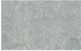
262135 dove grey

Marmoleum Decibel is a natural, bacteriostatic linoleum floorcovering with a jute backing for dimensional stability and a polyolefin layer for sound insulation and comfort. Marmoleum Decibel's Topshield 2 finish provides improved maintenance and long-term appearance retention.