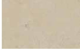
371135 cloudy sand