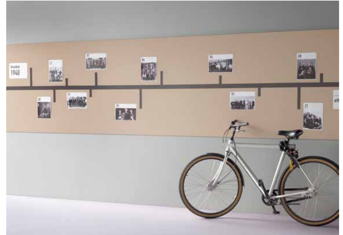
2186 | blanded almond 3363 | walton lilac