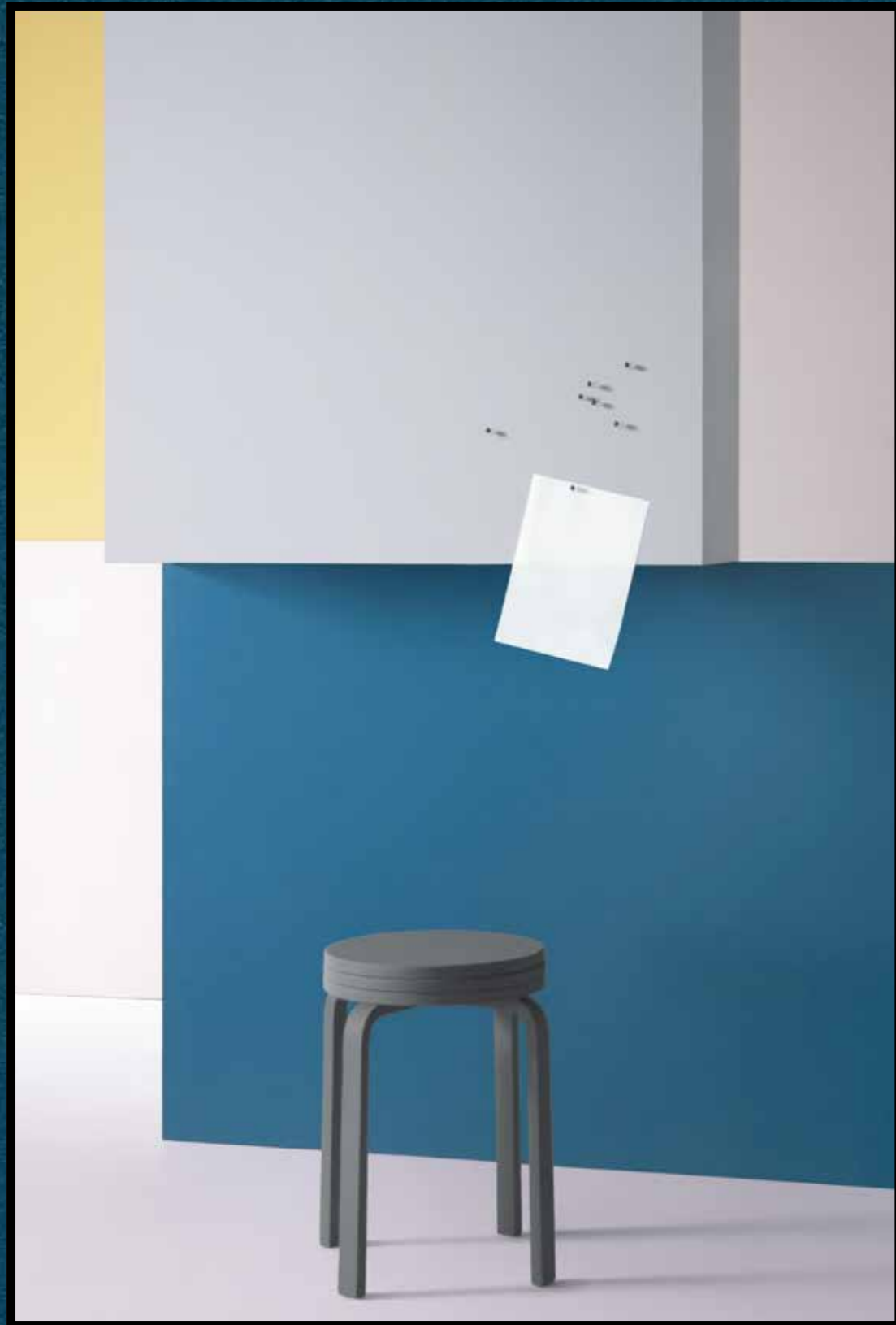
2162 | duck egg 2186 | blanded almond 2214 | blue berry 3363 | walton lilac