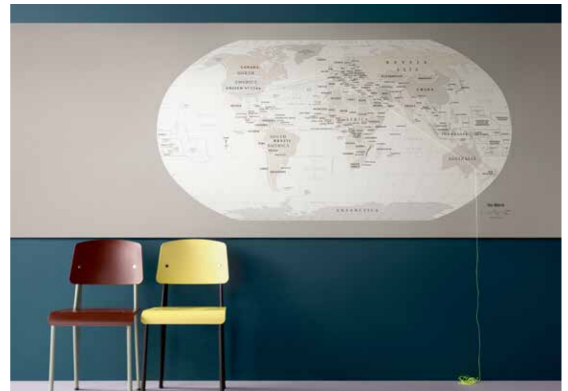
2182 | potato skin 3363 | walton lilac

BULLETIN BOARD is supplied in rolls of up to 28 metres long and 1.22 metres wide, making it suitable for large installations in for example conference rooms or alongside corridors. 3 colours are also available at 1.83m wide.