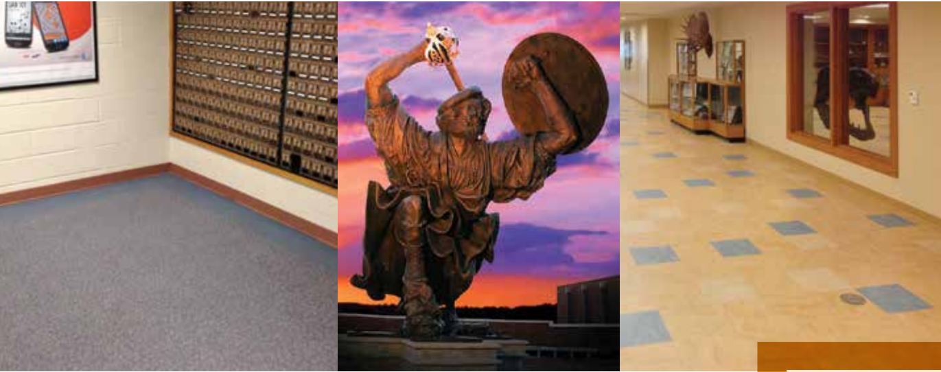
Edinboro University, Cooper Hall