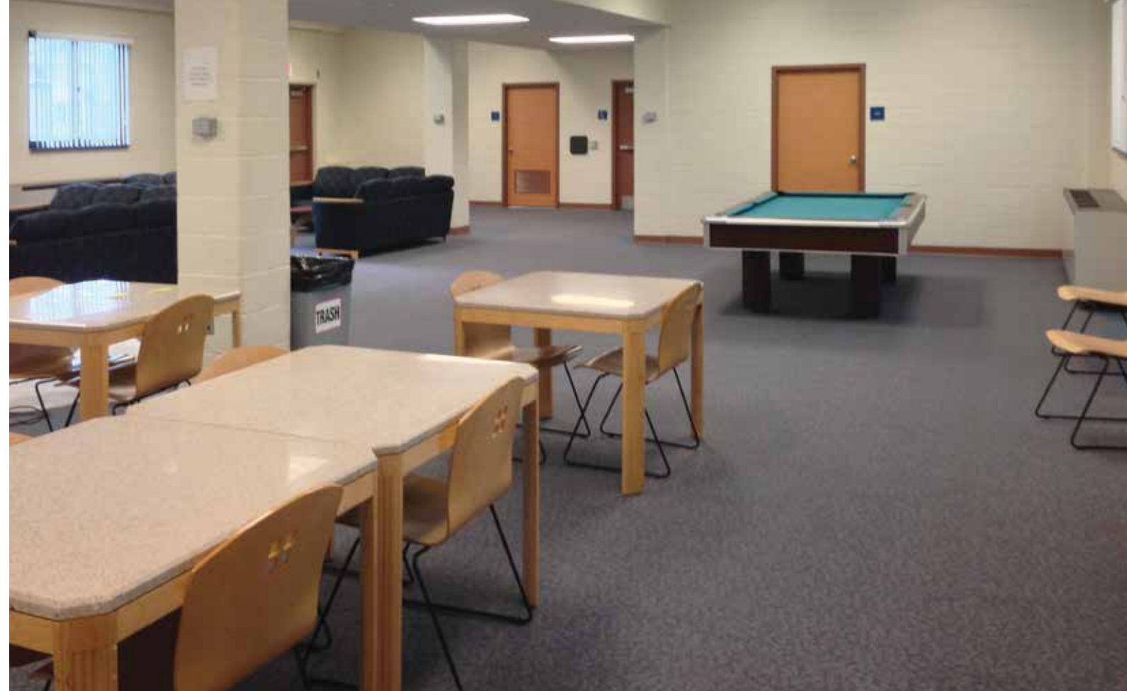
Edinboro University, Earp & Deerborn dorms – Flotex

Everyday cleaning is equally easy, thanks to the fact that Marmoleum doesn’t require the periodic stripping and refinishing of VCT. Basic dust mopping, neutral clean auto scrubbing and an occasional red pad spray buffing is all Marmoleum needs to keep its like-new look. “The less chemical we use, the more we like it,” Hinkle added.