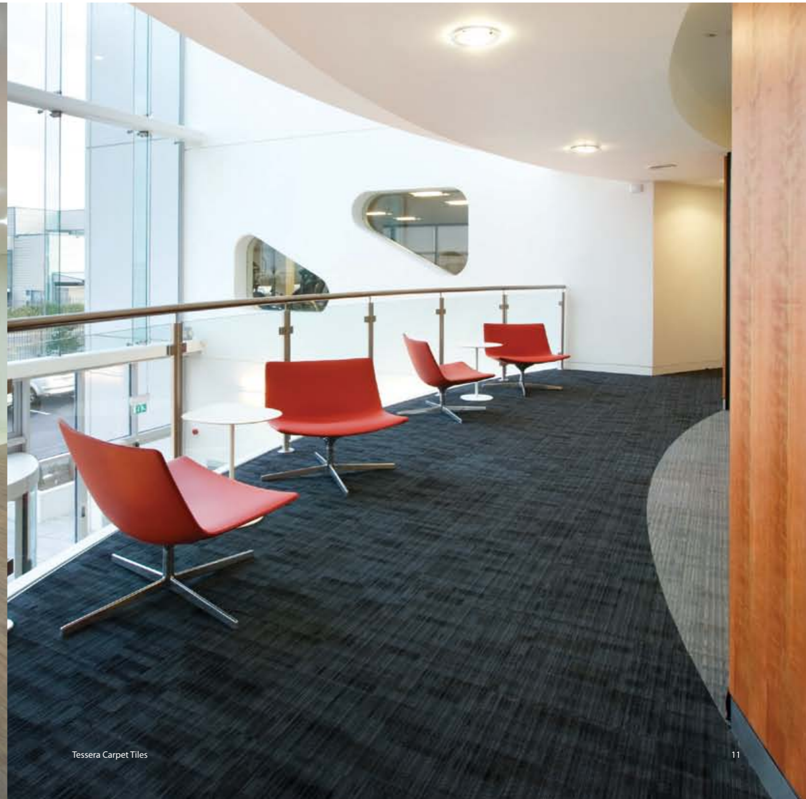
Tessera Carpet Tiles