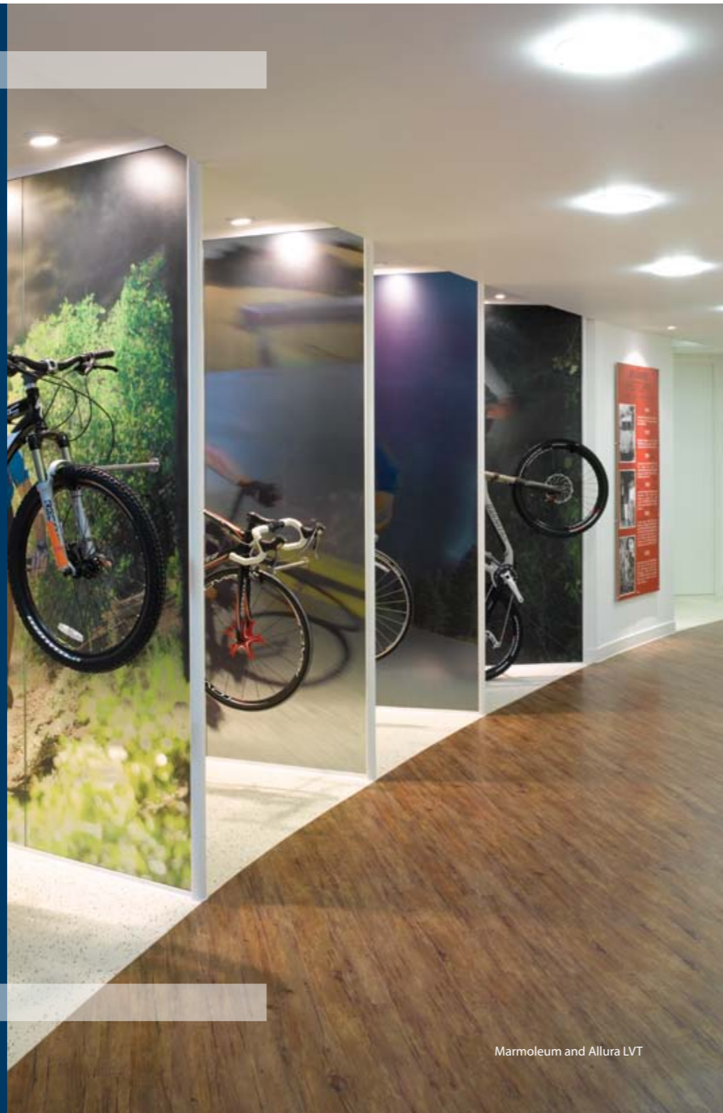
Marmoleum and Allura LVT

Because we offer the largest and most comprehensive range of floor coverings, you can always rely on us to advise you openly and honestly on the best floor covering product, or combination of different products, to meet your requirements.