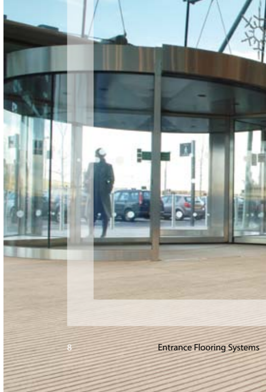
Entrance Flooring Systems