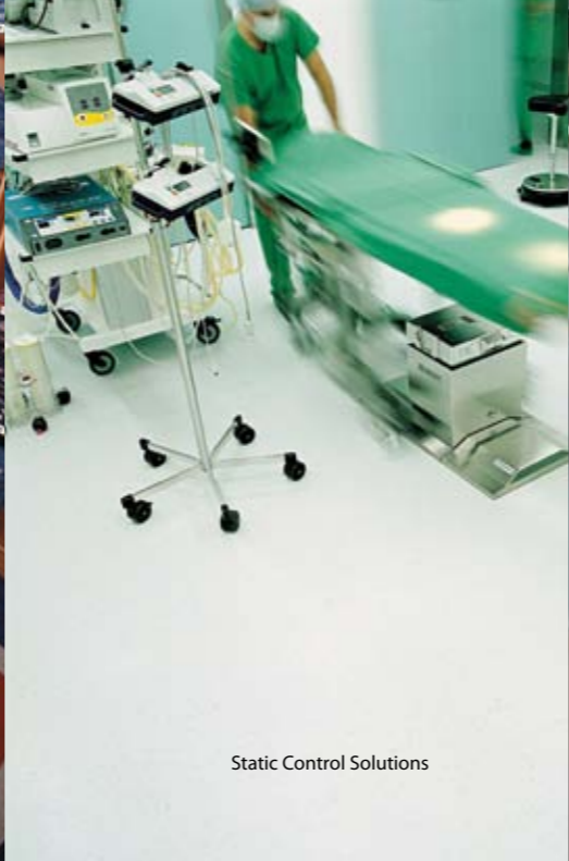
Static Control Solutions