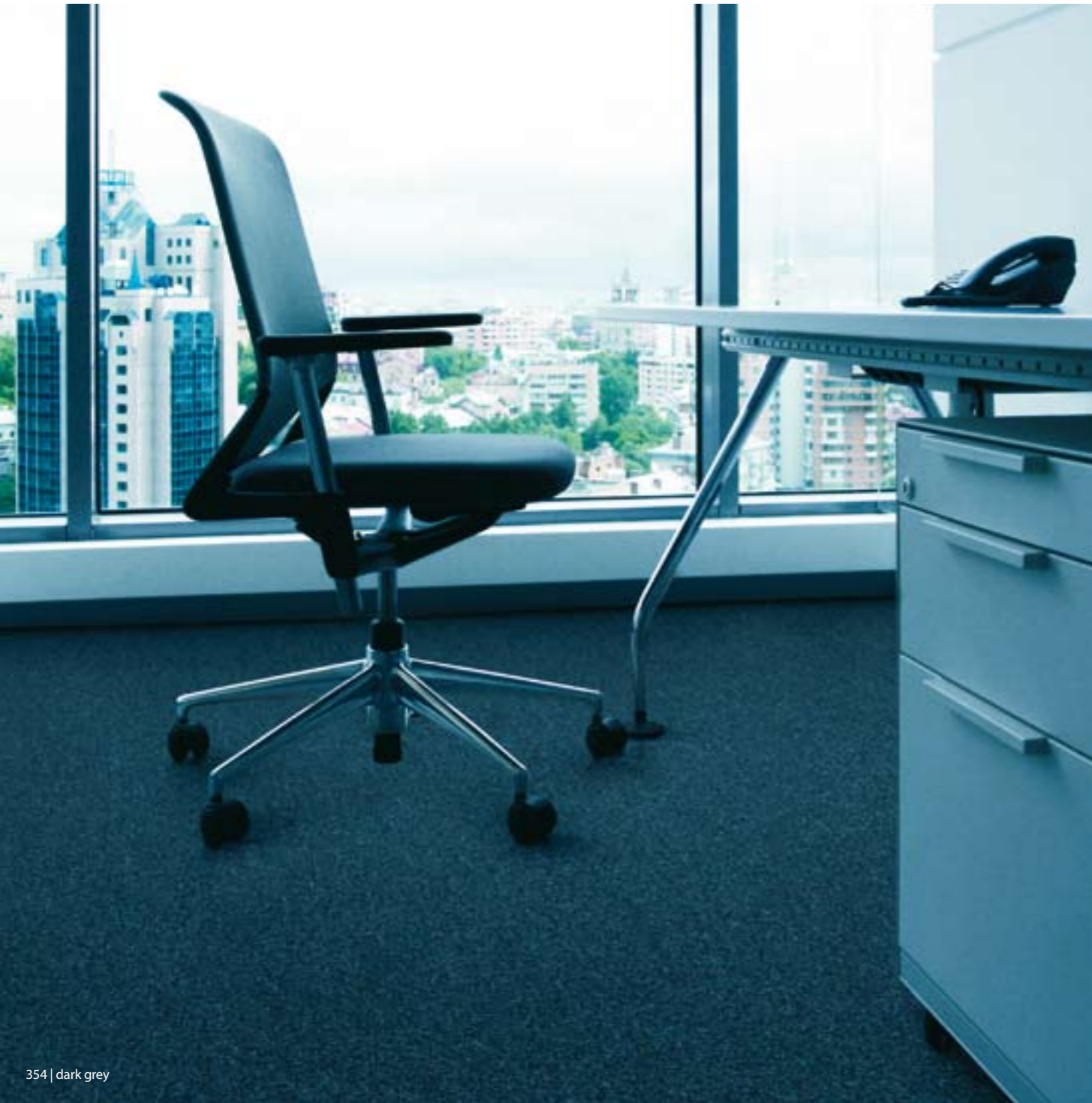
354 | dark grey

Suitable for every type of commercial installation, Tessera Basis fits throughout the building, wherever an attractive and hardwearing modular floorcovering is required. Manufactured from 100% Aquafil nylon, it has the resilience and durability needed to contend with the heavy wheeled traffic conditions often found in busy environments.