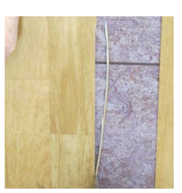
Fig.1 Fig.2 Fig.3

Note: if the print line is visible on the wider selvedge side of the sheet trim the sheet along the print line.