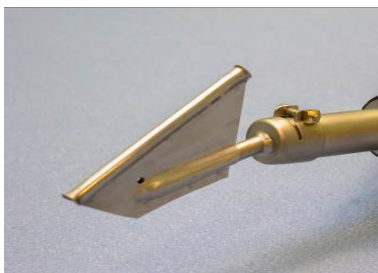
Speed Weld Nozzle for wall coverings

Tools: Janser UK - Tel 0121 5615888; Web: www.janser-uk.co.uk