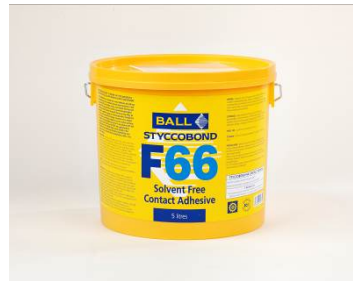
Solvent Free contact adhesive: F66

Note: Porous substrates should be primed with a suitable primer in accordance with the adhesive manufacturer's recommendations – contact F Ball & Co Ltd for substrate specific recommendations.