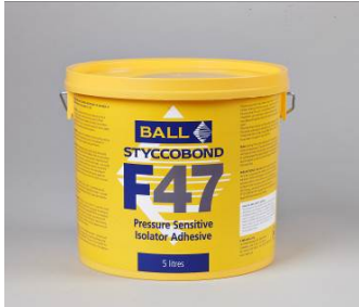
Wall covering adhesive: F47

Recommended Adhesives: F Ball & Co: Email: mail@f-ball.co.uk ; Website: http://www.f-ball.co.uk