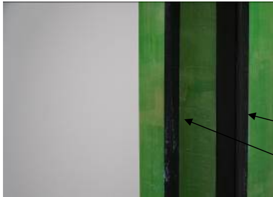
QCF35 Cove Former

Fitting of the wall covering around sharp external corners will be made easier with the use of an external PVC corner profile (Quantum Profile EFA75).