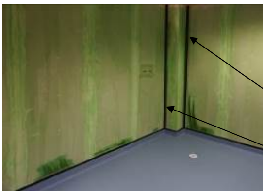
QCF35 Cove Former

Forbo recommend that pre-formed PVC cove formers (Quantum Profile QCF35) are used on all internal corners. This will provide the optimum hygienic installation and facilitate a smooth transition of the wall covering through the corner.