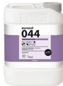
Package 2,5 kg