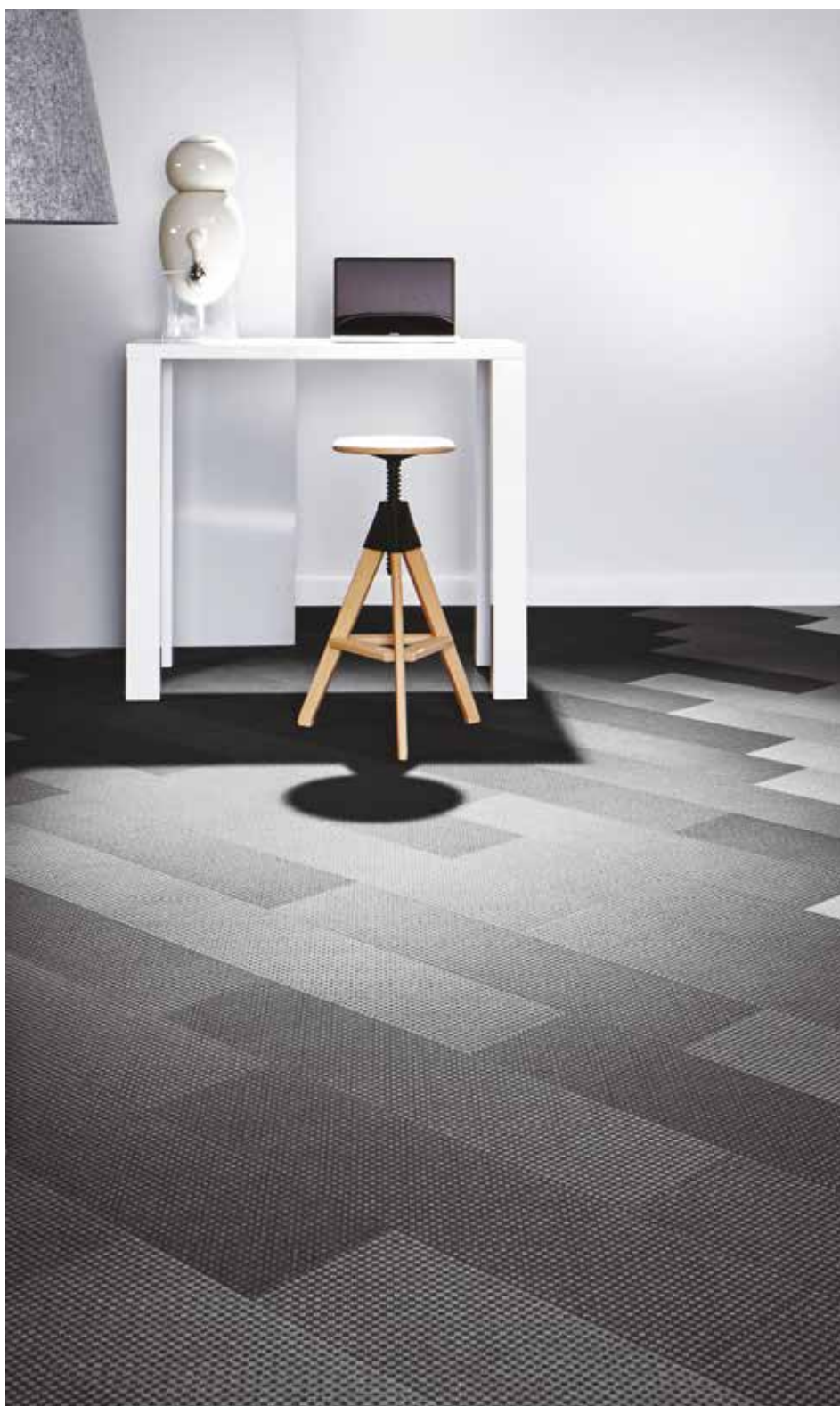
133007 | granite

Subtly changing from a box to a cross, the motif seems to fade in and out creating light and shade that bring contrast and interest. The effect is both stylish and sophisticated, forming a unique visual look that works in both large and small areas.