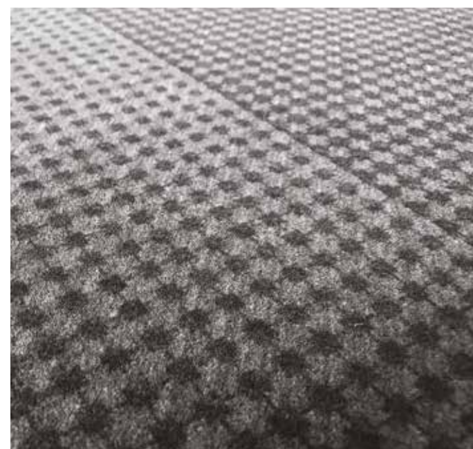
133007 | granite