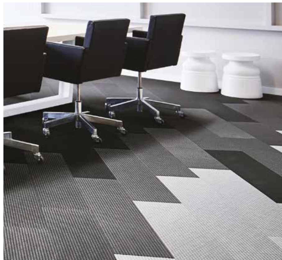
133002 | pearl 133007 | granite 133011 | anthracite