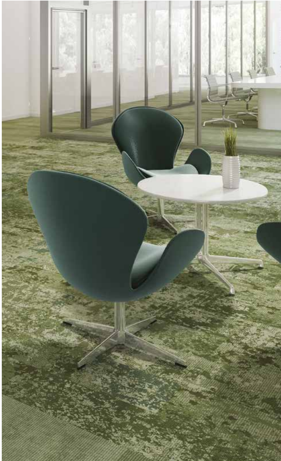
147001 | boreal