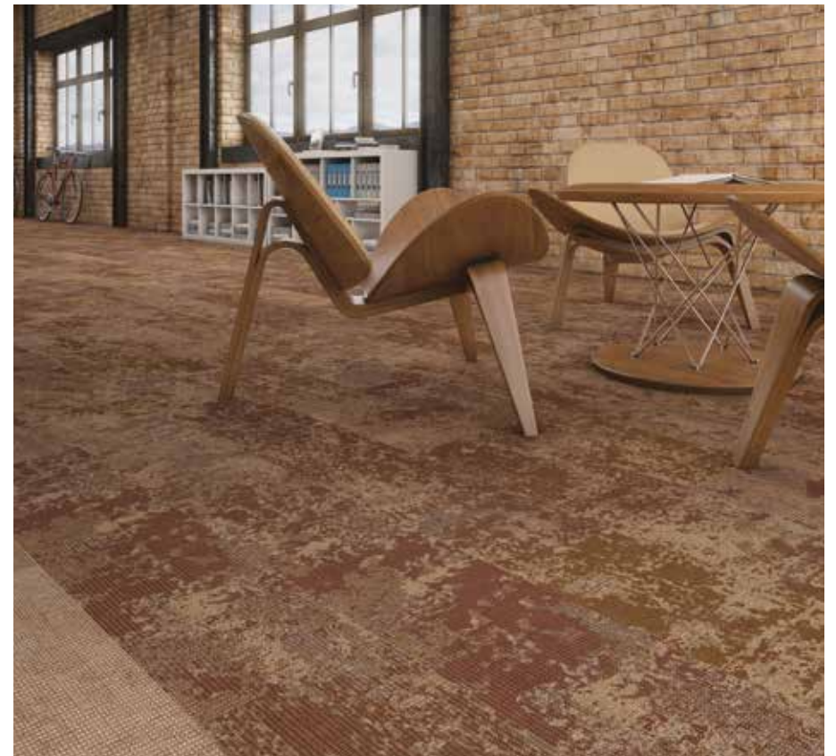
147008 | tundra