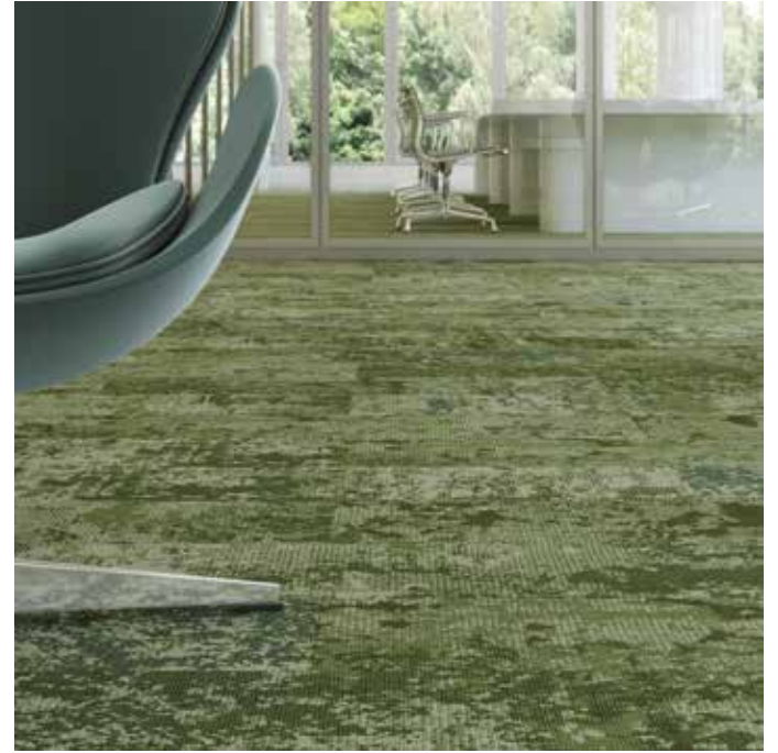
147001 | boreal