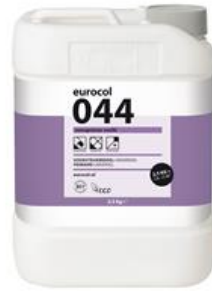
Package 2,5 kg