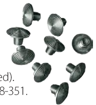
3679 - Inox

Kit of 200 studs with installation template included