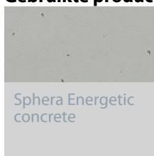
Sphera Energetic concrete