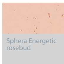
Sphera Energetic rosebud