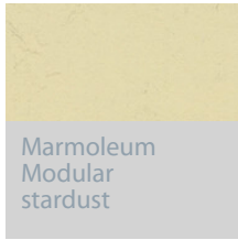
Marmoleum Modular stardust