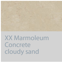
XX Marmoleum Concrete cloudy sand