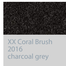
XX Coral Brush 2016 charcoal grey