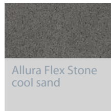
Allura Flex Stone cool sand