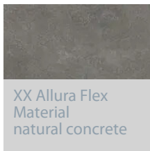
XX Allura Flex Material natural concrete