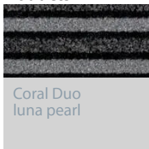
Coral Duo luna pearl