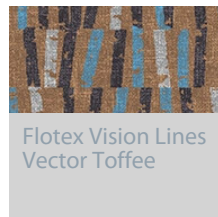
Flotex Vision Lines Vector Toffee