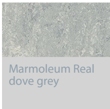
Marmoleum Real dove grey