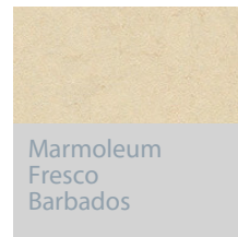
Marmoleum Fresco Barbados