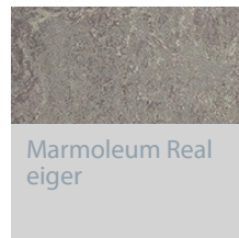
Marmoleum Real eiger