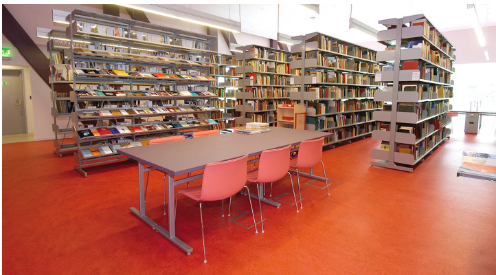
Marmoleum Fresco African desert