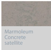
Marmoleum Concrete satellite