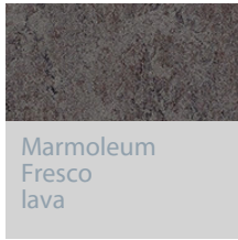
Marmoleum Fresco lava