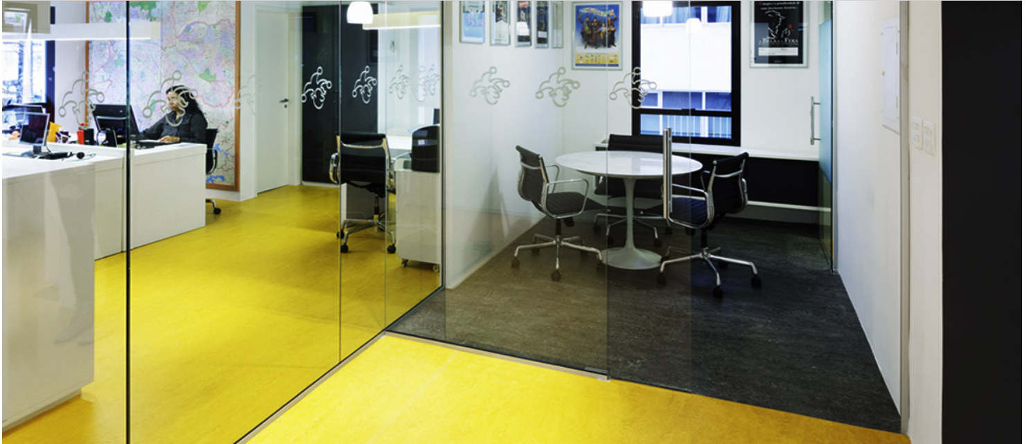
Diverte Cultural Office