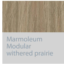
Marmoleum Modular withered prairie