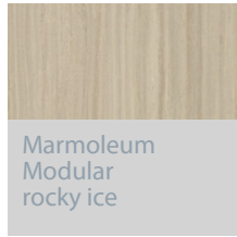
Marmoleum Modular rocky ice