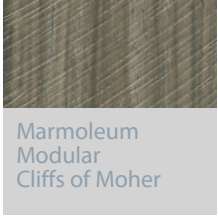
Marmoleum Modular Cliffs of Moher