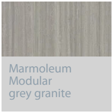
Marmoleum Modular grey granite