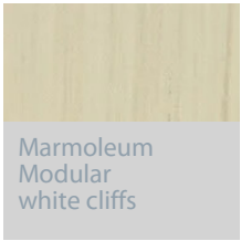
Marmoleum Modular white cliffs