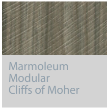
Marmoleum Modular Cliffs of Moher