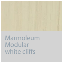
Marmoleum Modular white cliffs