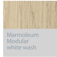
Marmoleum Modular white wash