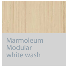
Marmoleum Modular white wash