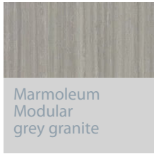
Marmoleum Modular grey granite