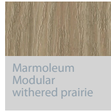
Marmoleum Modular withered prairie