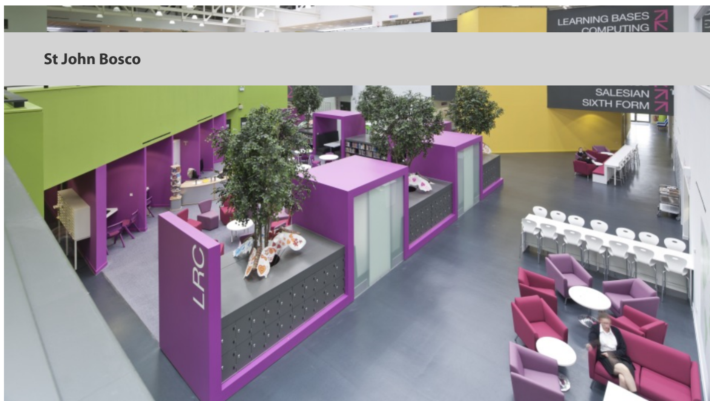
St John Bosco

St John Bosco, an exciting, vibrant and dynamic girls' Catholic Comprehensive school, recently built, was designed by Building Design Partnership who specified Sarlon acoustic flooring, Surestep and Safestep from Forbo Flooring Systems to be installed throughout the school to create a warm and friendly atmosphere.