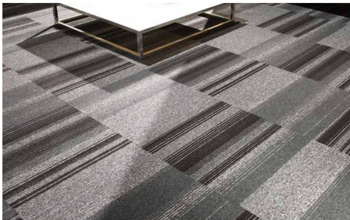
Create Space 2 licorice | Create Space 3 agate