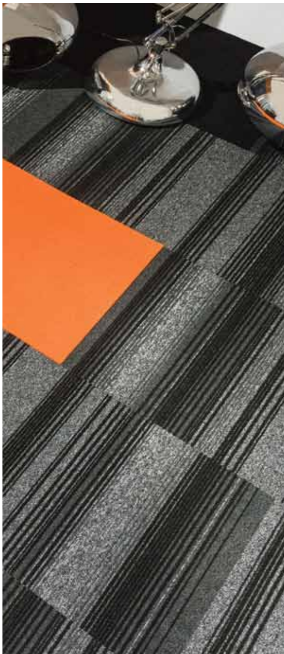
Create Space 3 agate | Westbond dutch orange

The distinctive and luxurious velvet stripe of Create Space 3 adds sophistication and depth making it suitable for any size of interior flooring scheme. Each of the 15 Create Space 3 colourways features a subtle tonal progression of hues which produces a diffused geometric linear effect. The cut and loop pile construction provides a rich burst of colour and texture, giving an opulent effect.