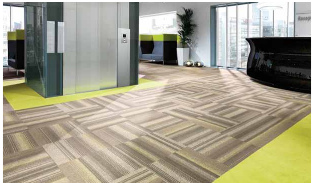
Create Space 3 serpentine | Westbond citrus