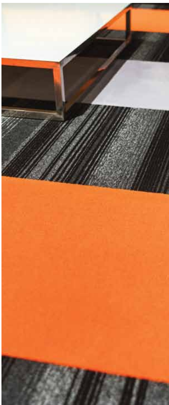
Create Space 3 agate | Westbond dutch orange and dove

The design possibilities are enhanced by the ability to use Create Space 3 luxurious cut and loop pile, in conjunction with Create Space 1 semi-plain loop, Create Space 2 linear loop, or with Westbond rich fusion bonded cut pile for added luxury.