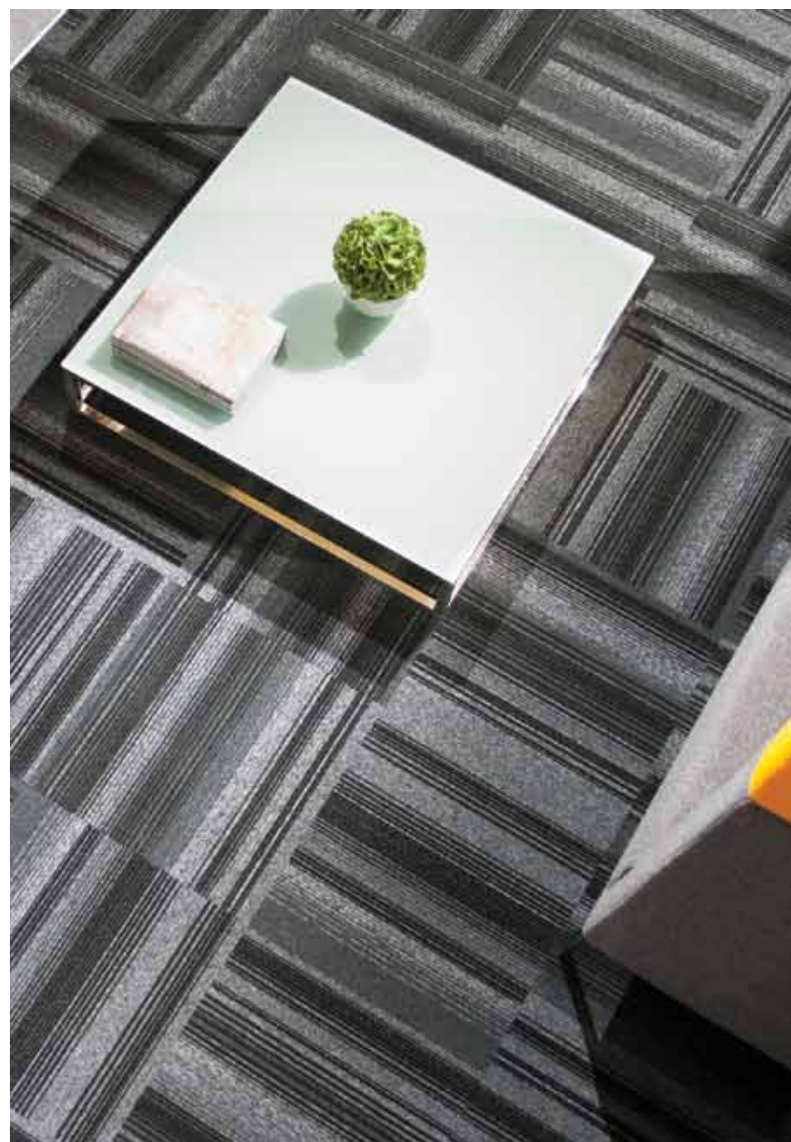
Create Space 3 agate

These waste streams are regenerated into new caprolactam, the building block of polyamide, so that the normal limitations on colour choice and vibrancy imposed when using conventionally recycled yarns, simply do not apply.