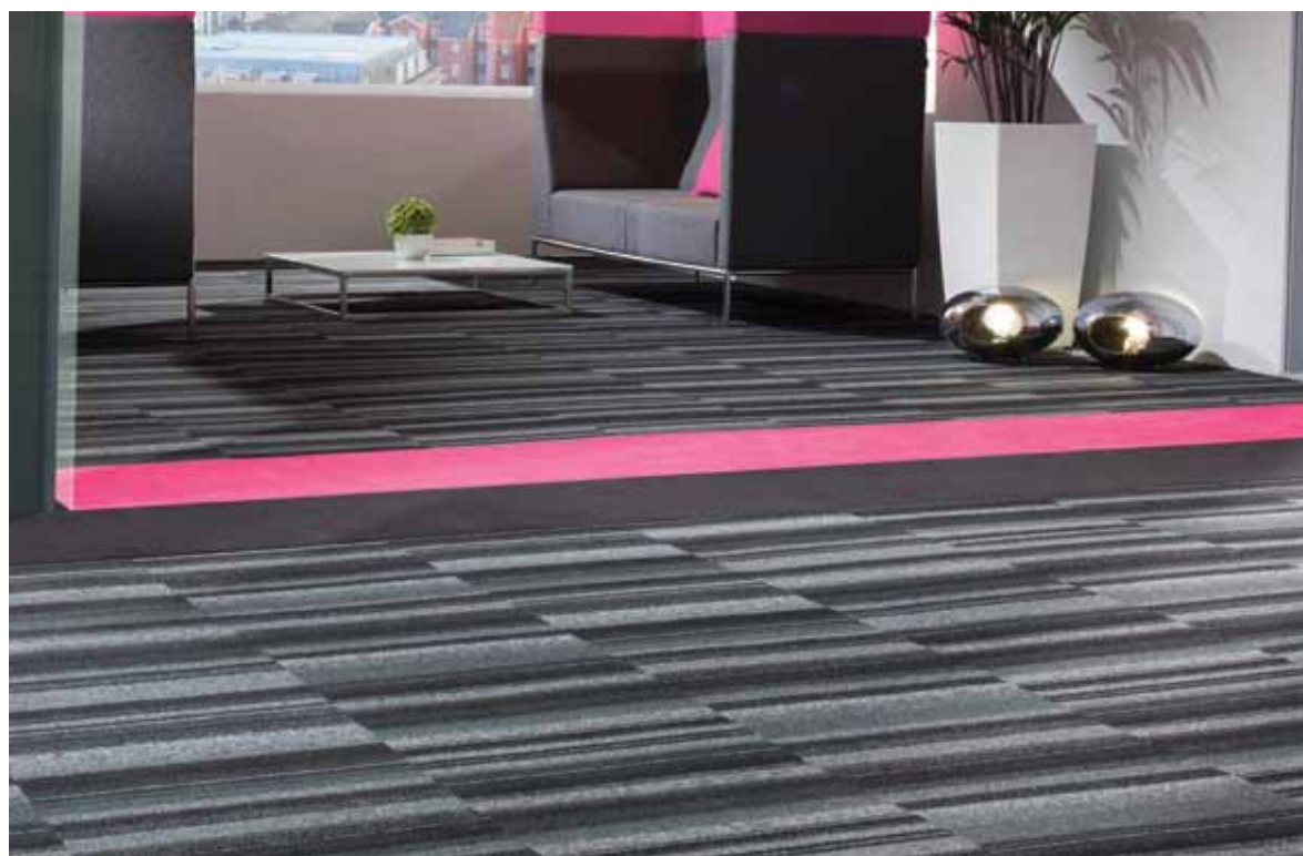
Create Space 3 agate | Westbond douglas pink and jet