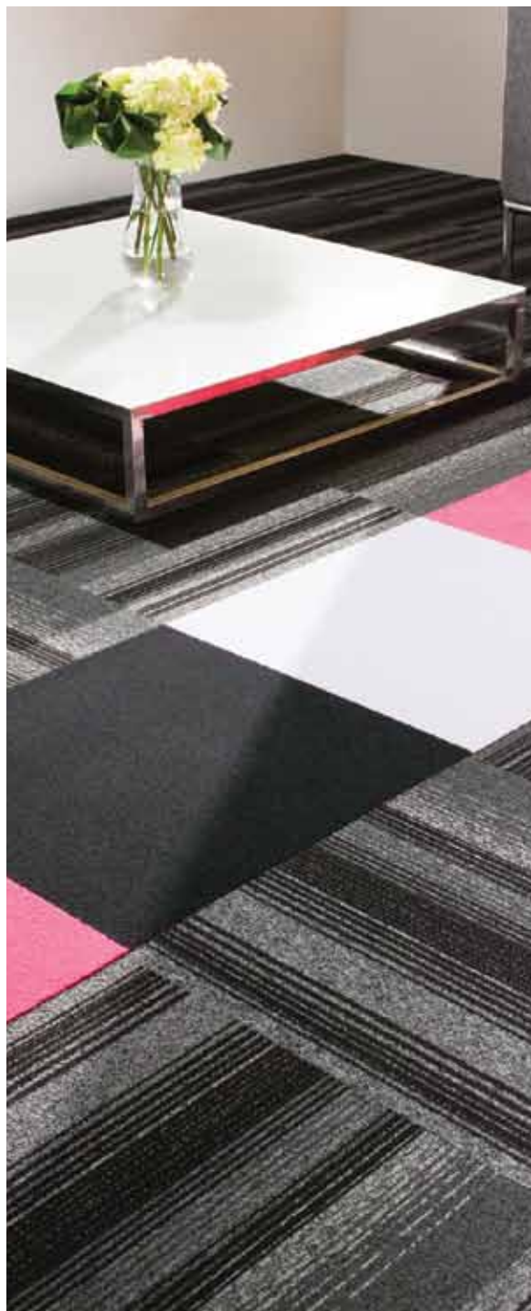
Create Space 3 agate | Westbond douglas pink, jet and vapour

Meeting spaces, walkways and clearly defined breakout areas can all be incorporated into the floor design by combining the various elements of the Create Space collection.