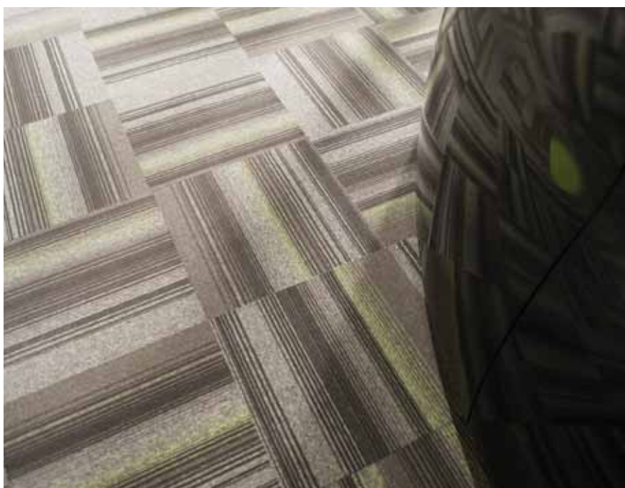
Create Space 3 serpentine

Designed in line with Forbo's Green Design principles, Create Space 3 is manufactured in the United Kingdom using precision tufting technology and an ultrasonic tile cutting process which reduces tile waste by 80% compared to traditional press cutting methods. When Create Space 3 is fitted non-directionally, installation waste is minimised to 2%.